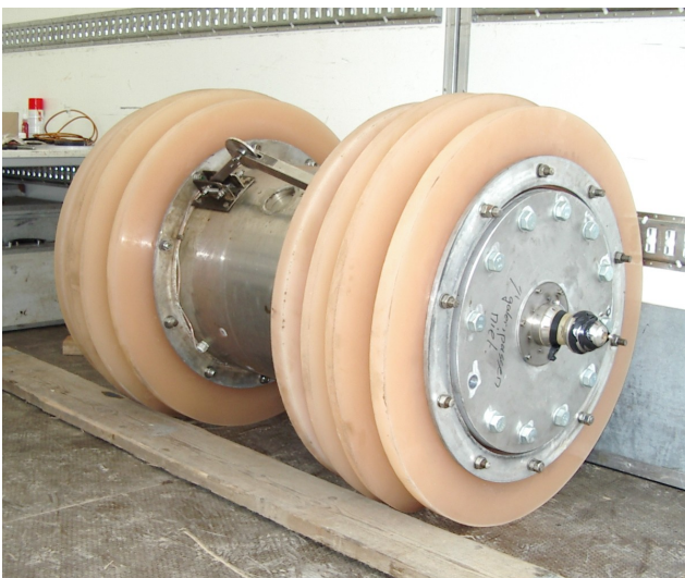
Figure 2 Tethered UT

There are many different inspection methods available to the pipeline operator. These range from simple bore inspections using a metal gauging disc to ultrasonic crack detection systems. In recent years there has been an explosion in the number of companies offering inspections and in the range and combinations of technologies available. You can choose from DMR, EMAT, TFI, UT, CD, MFL, GUL, geometry, profile, tethered, bi-di, laser, etc. etc.. Identifying the appropriate technology, and the companies best able to offer that technology is not simple. Some examples of different inspection pigs are show in , , and .