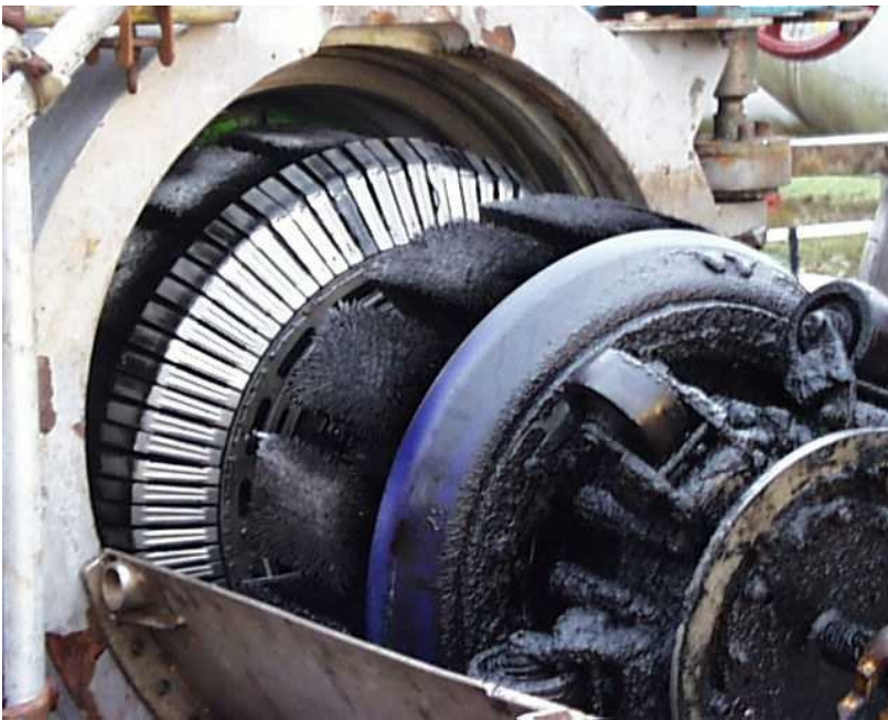
Figure 4 MFL Inspection Pig

The technology that should be chosen depends on the defects that are of concern and the feasibility of using a particular system in the pipeline being considered. API 1160 1 provides a summary of the defects that different intelligent pigs can detect, see . It should be noted that as technology improves this guidance may become out of date.