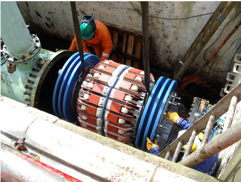
Figure 3 Bi-directional MFL