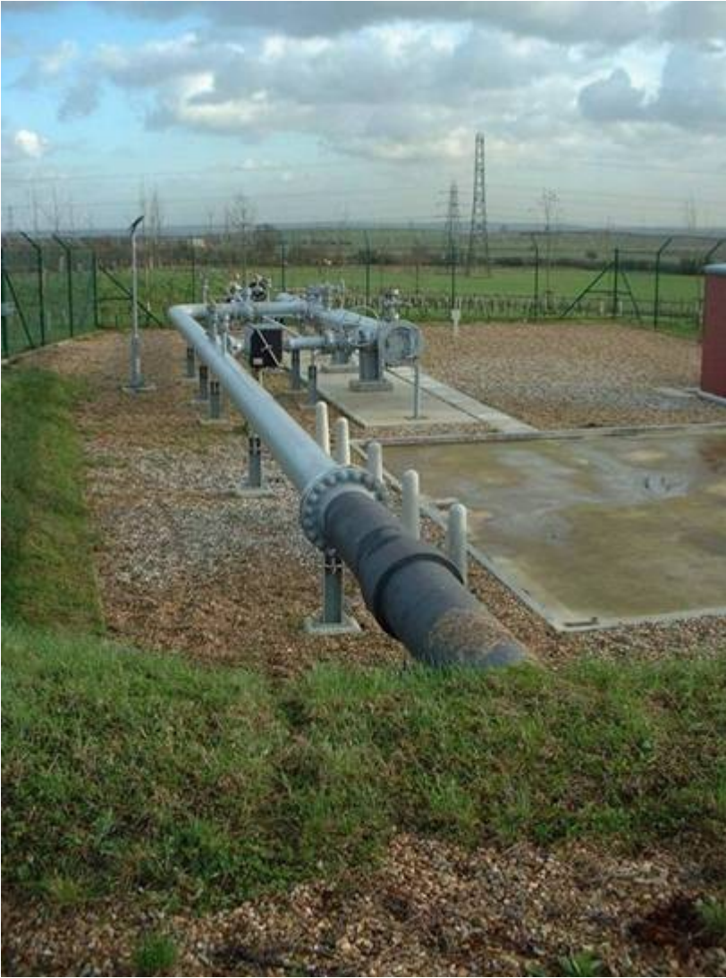
Figure 6 Pig trap and working area