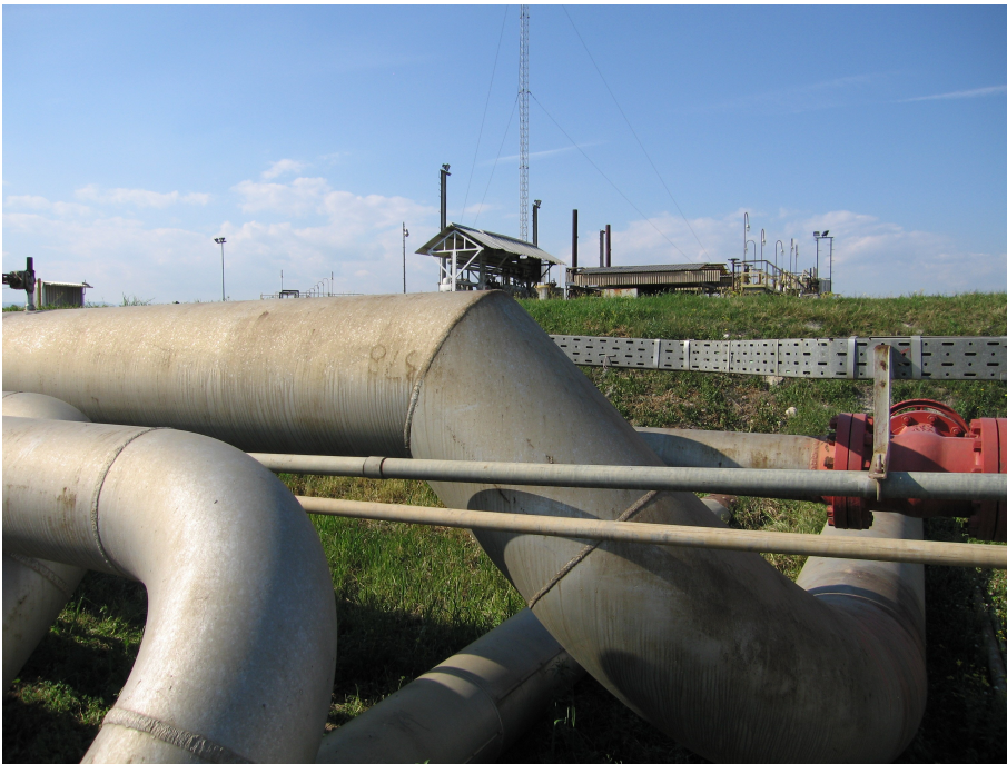
Figure 5 Mitre bend