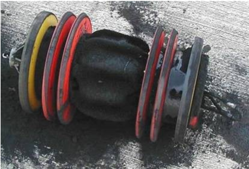
Figure 7 'Black Dust' cleaned from a gas pipeline

During the preparatory phase there will be a need to liaise with health and safety representatives, control room staff, technicians, the inspection company, and management. The effort required should not be underestimated and the appointment of an experienced inspection project manager will help.